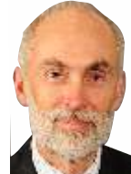
Neville Horner Committee